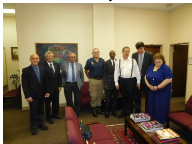
Meeting with representatives of the Mayor's office and the Metropolitan police department