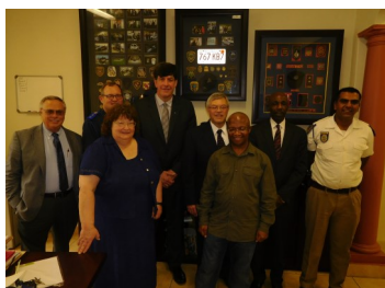
Diplomatic Liason Office