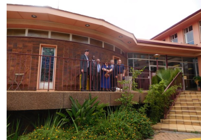
National Parks Headquarters